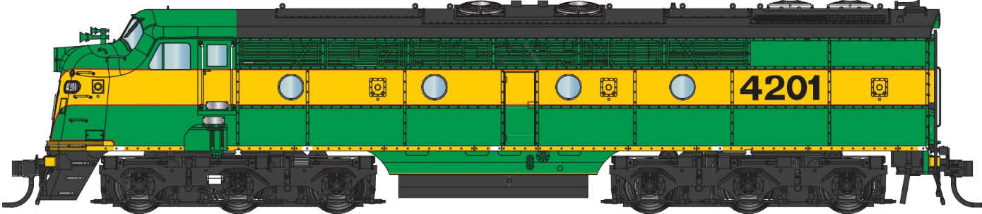
4201 - Green/ Yellow - Double Marker Lights