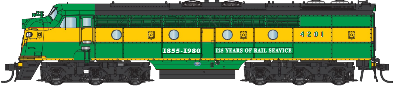
4201 - 125 Years - Single Marker Lights