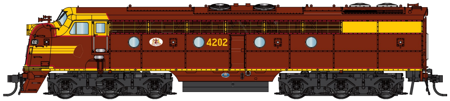
4202 - INDIAN RED