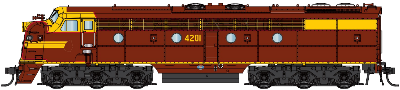
4201 - INDIAN RED