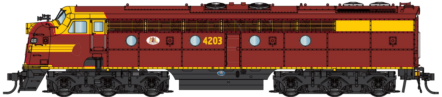
4203 - INDIAN RED