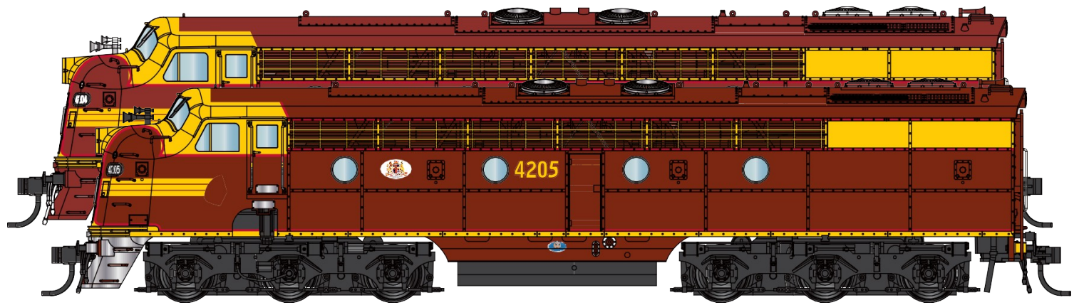
4204 - INDIAN RED