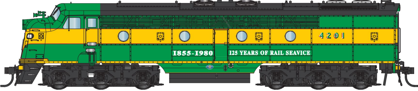
4201 - 125 Years - Double Marker Lights